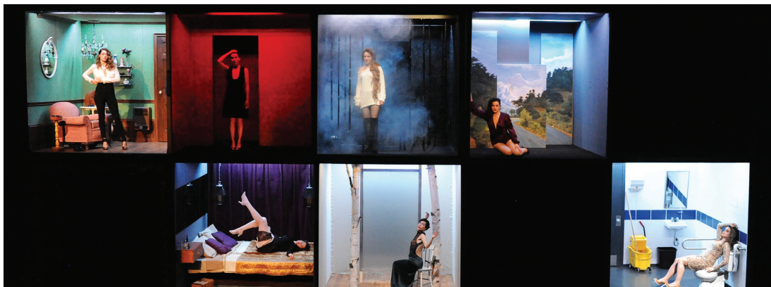
La fureur de ce que je pense