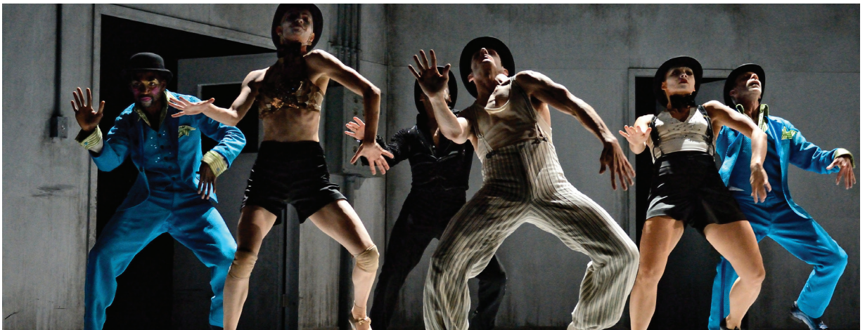
Betroffenheit