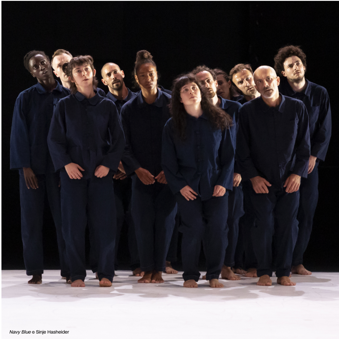
Navy Blue

Confidential until March 21, 2023, at 5:30 p.m.