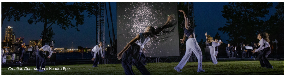
Creation Destruction © Kendra Epik

Laurence Rajotte-Soucy 514 513 1235 laurence@rugicomm.ca