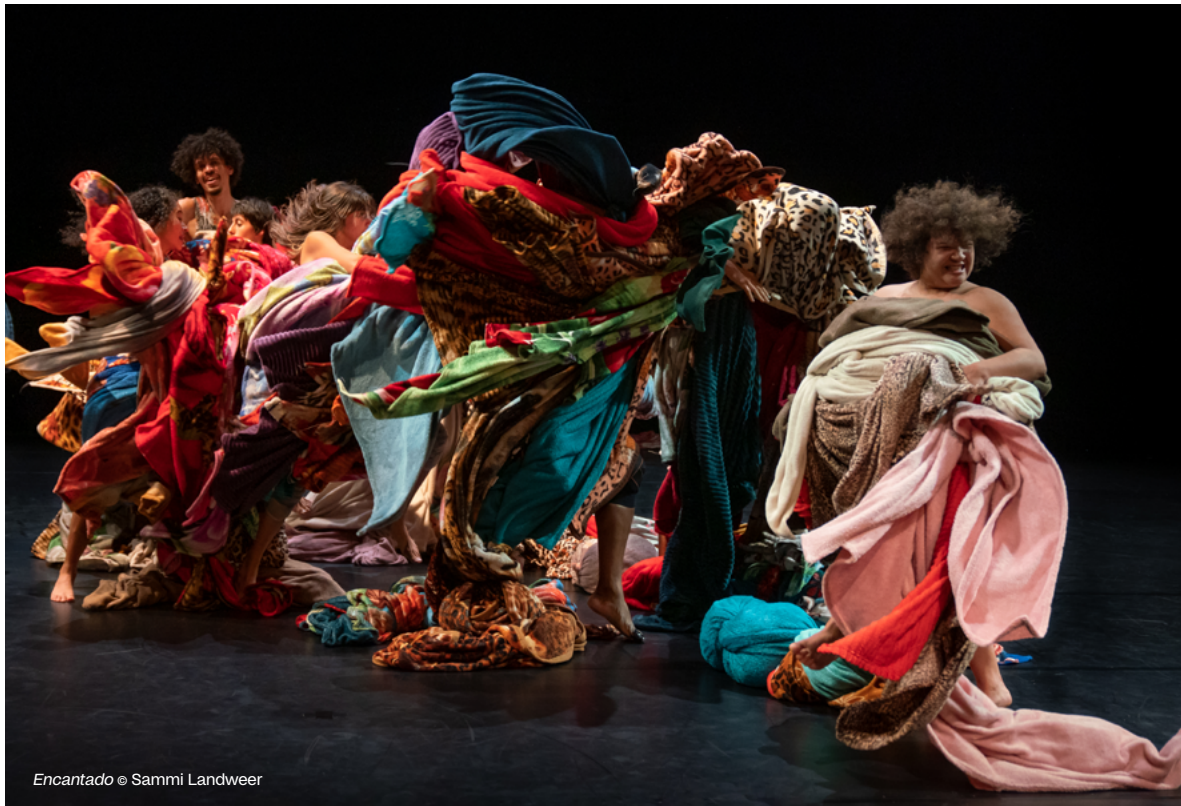
Encantado © Sammi Landweer

Confidential until March 21, 2023, at 5:30 p.m.