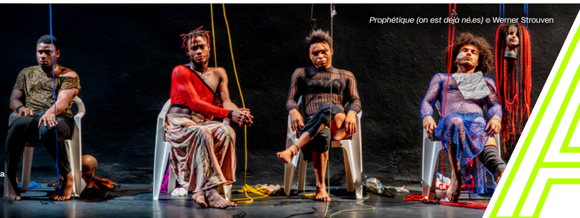
Prophétique (on est déjà née.es)