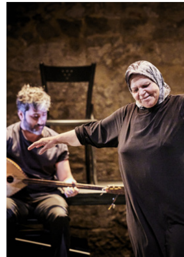
Told by My Mother